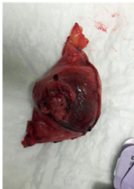
Figure 4: The neoformation does not ulcerate the mucous membrane, it is 0.5 cm from the surgical resection margin and is close to the serous cassock.

fixation) of 5.5 cm, of a yellowish-white color, with hemorrhagic areas, duraelastic consistency, fasciculated appearance and well demarcated margins is identified. The neoformation does not ulcerate the mucous membrane, it is 0.5 cm from the surgical resection margin and is close to the serous cassock (Figure 4). At the microscopical examination, a mesenchymal neoplasm consisting mainly of epithelioid cells, which develops in the context of the gastric wall (from the submucosal to the subserosal cassock) was found, with the presence of hemorrhagic areas. Absence of necrosis, calcifications, cellular pleomorphism. Mitotic index: low (2 mitoses / 5 mm 2 ); proliferative activity (evaluated with Ki-67%): low (2%). Surgical resection margin and deep margin unharmed. Positivity for vimentin, C-KIT (CD117), DOG-1 (ANO1), CD34 and negativity for desmin, smooth muscle actin, S100 were detected.