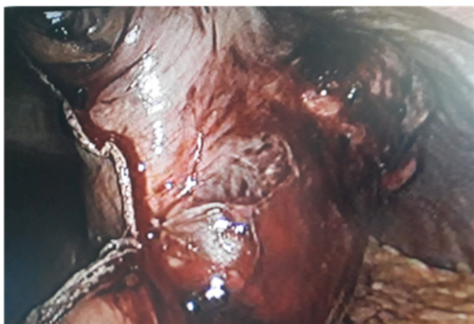
Figure 3: Sleeve gastrectomy including the aforementioned lesion, with endo gia (4 refills of 60).

The operative time was 120 minutes, and there was not significant blood loss. Postoperatively, the patient recovered well and was discharged by the eight postoperative day. To date the patient is in good health and disease free; control EGDS one year after surgery reported normal gastroresection outcomes. Anatomicopathological examination reported at the level of the submucosal tunic, a neoformation of the largest diameter (estimated after