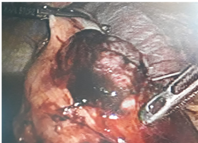
Figure 2: Neoformation on the posterior gastric wall, with a prevalent exophytic development, of about 6 cm of max diameter.

Laparoscopic access in the peri-umbilical site and under vision of another 3 trocars in the usual sites; negative exploration for hepatic and / or peritoneal repeats; opening of the gastrocolic ligament with Ultracision and access to the retrocavity of the epiploons, with a finding of neoformation on the posterior gastric wall (Figure 2), with a prevalent exophytic development, of about 6 cm of max diameter, facing great curvature, below the fundus. Further mobilization of the stomach: we proceed to sleeve gastrectomy including the aforementioned lesion, with endo gia (4 refills of 60) (Figure 3). Some hemostatic points on the cut, intracorporeal. Positioning of SNGs; washes, n. 1 drain; layered synthesis of 10 mm breccias.